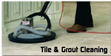
Tile & Grout Cleaning

The Prodigy is designed to help you grow your business into these and other areas without needing to buy additional specialty machines.